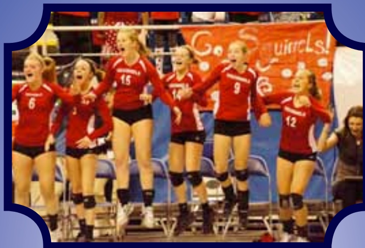
Pictured Above: Casselton volleyball team upon winning the State Class B Volleyball Championship