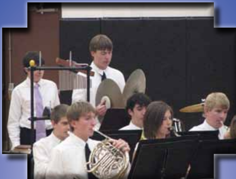
Pictured Above: Larimore High School Band